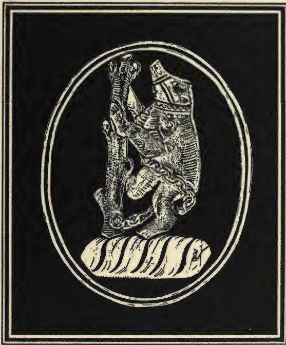
ROBERT DUDLEY, EARL OF LEICESTER.